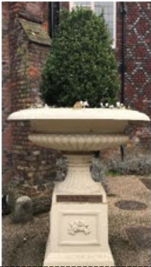
Cut me out with the plant above