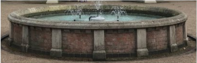
Cut me out with the fountain above