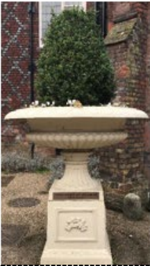
Cut me out with the plant above