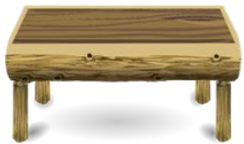
Table – a rough table of wood that could be dismantled easily.

Reeds & hay – would have been strewn on the floor and changed regularly.