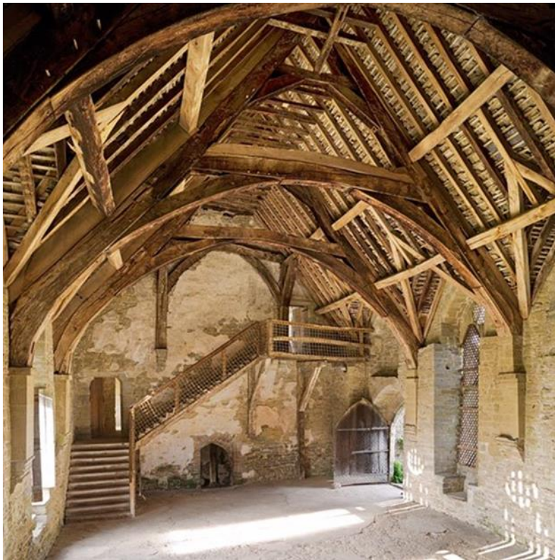
Stokesay Castle medieval great hall

The servants at the Palace have been cleaning the great hall and everything is a mess! Do you know which items below belong in the great hall? Circle what you think belongs in the room and then see if you are right with the answers below!